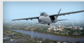
HUMANITARIAN ASSISTANCE / DISASTER RESPONSE