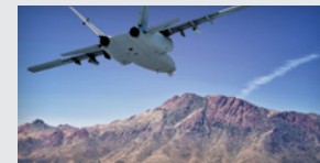
IRREGULAR WARFARE SUPPORT