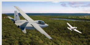
AEROSPACE CONTROL ALERT

The Scorpion is designed for versatility. Its ability to carry internal loads, power a wide variety of sensor and communications packages, and employ a wide range of scaled munitions makes it the ideal fit for permissive military and homeland security environments.